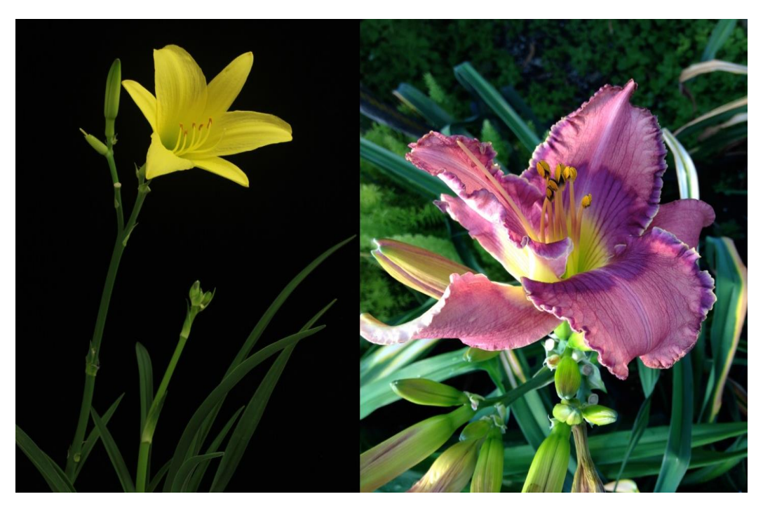
Figure 4. The two most fragrant daylilies, in terms of total volatile emissions, sampled in Florida . The species Hemerocallis thunbergii is shown on the left, and the hybrid 'Spacecoast Blue Eyed Majesty' is shown on the right.