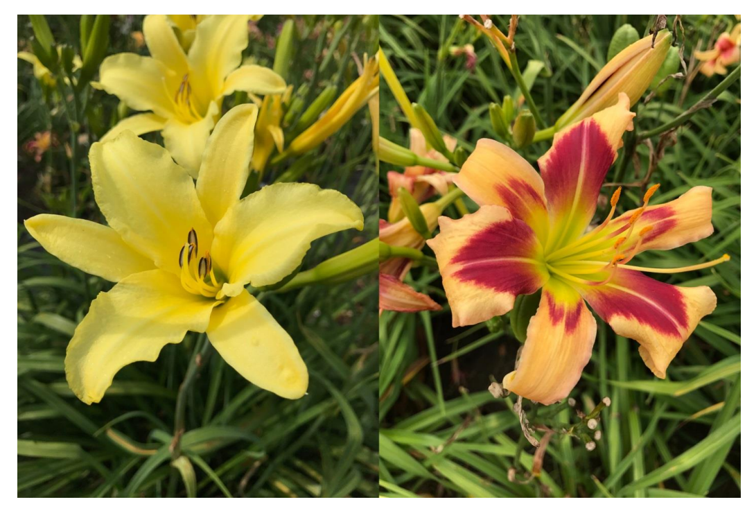
Figure 5. The two most fragrant daylilies, in terms of total volatile emissions, sampled in Ohio . The species Hemerocallis citrina is shown on the left, and the hybrid 'Out of Balance' is shown on the right.