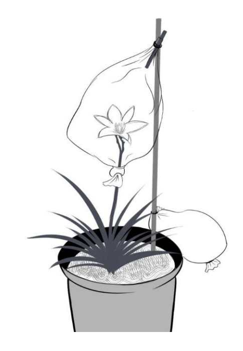
Figure 1. Schematic diagram of the collection system. The column containing the adsorbent polymer is attached to the upper part of the stake, and an empty bag, from which volatiles were sampled to account for background contaminants, is attached to the lower portion of the stake.

Following volatile enrichment, a single-setting vacuum pump (Barnant Company, Barrington, IL, USA) was used to pull the air out of the bag through the adsorbent trap for three minutes. On each collection date, volatiles were sampled from empty nylon resin bags to account for background contaminants. Volatiles were collected in duplicate from each daylily. Volatiles were eluted from the adsorbent polymer within 12 hours with 150 µL of methylene chloride spiked with 2 µL of nonyl acetate as an elution standard. Samples were stored at -80° C until analysis by gas Chromatography-mass spectrometry (GC-MS).