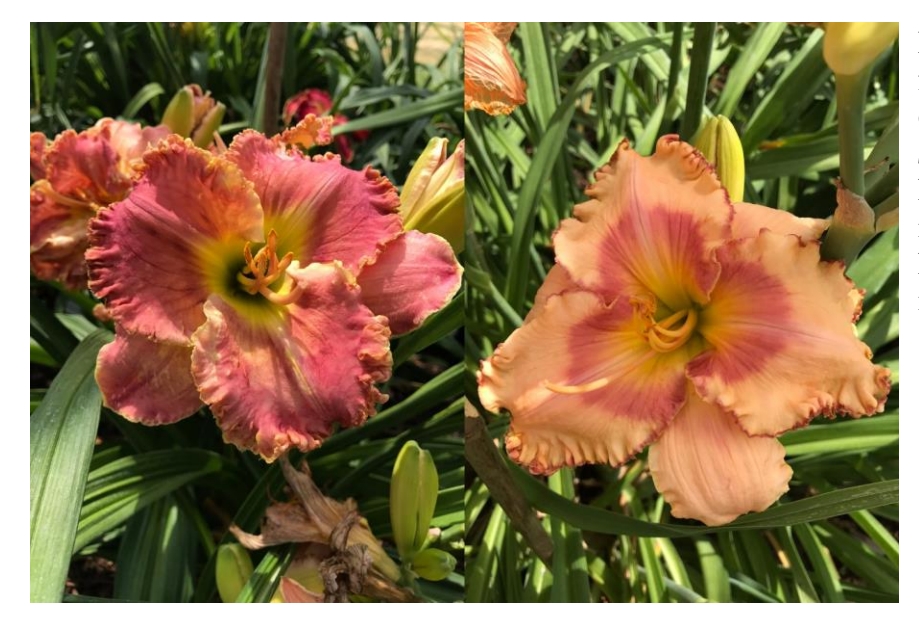
Figure 6. The two most fragrant daylilies, in terms of total volatile emissions, sampled in Utah. The hybrid 'Cranberry Daiquiri' is shown on the left and the hybrid 'Glistening Accent' is shown on the right.